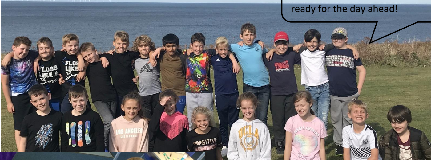
At Kingswood, we had to use our initiative to ensure we were ready for the day ahead!